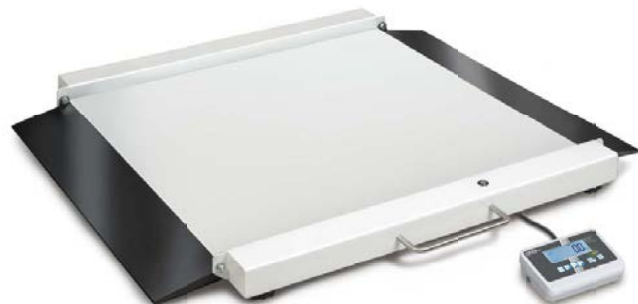
KERN MWA 300K-1M