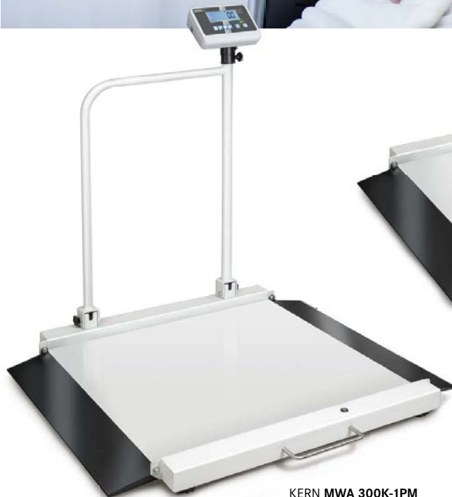
KERN MWA 300K-1PM