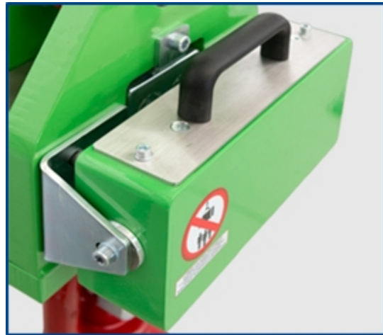
Fitted with extractable rechargeable battery pack.