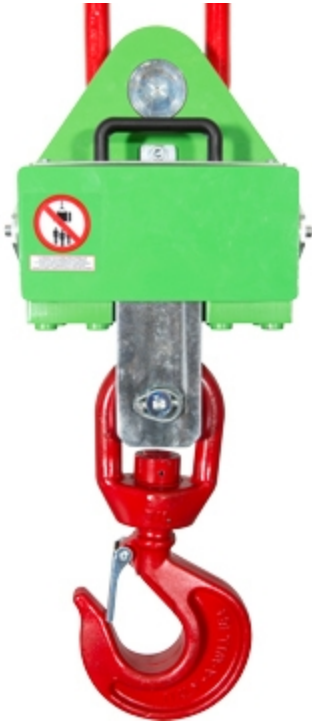
MCWHU: view of the back.