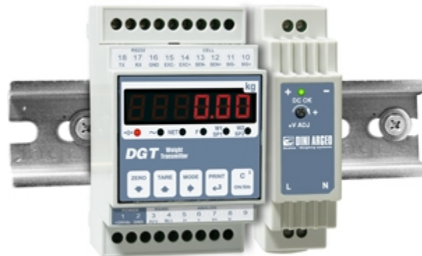
DGT1 with DR1512 optional power supplier, for DIN bar